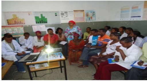
Review meeting held at Metehara Health Center

Expansion of the surveillance to health post level: after conducting an assessment in 3 representative Wordas, expansion was done as a pilot in seven health posts that are under Asendabo health center. This was done with the intention that data from the health posts will show cases by person, place and time in the smallest sampling frame. Currently the total number of health posts under surveillance has reached 25. (i.e. 7 at Asendabo HC, 6 at kersa HC, 12 at Bulbual HC.). Data generation has already been started from the seven health posts in Asendabo where it was possible to get important information.