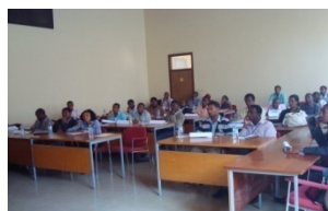
Initial training on malaria surveillance

Data collection tools: three data collection have been developed by ACIPH and TU/USAID for data collection from health centers, these are adult OPD register, under five OPD register, laboratory OPD register. A tool has also been developed for the data collection in the health posts. In addition a supervisory check list has been developed to undergo supportive supervision in both the health centers and Health posts.