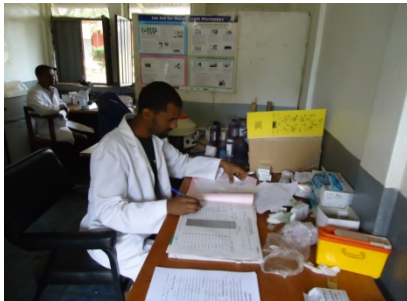
Asendabo Health Center Laboratory Diagnosing and recording Results

Data collection and analysis: To contribute for better use of surveillance data in the malaria control and prevention decision making, peculiarly in the early malaria epidemic detection and containment, Data are collected analyzed and interpreted. The vivax malaria epidemic that has been detected and contained by the surveillance process in October in Tulubolo was atypical example. A five year retrospective (1997-2002 E.C.) data on malaria laboratory test was collected from five of the primary sites.