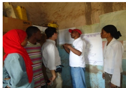
Joint Supervision in Seyo Adami Health Post

Supportive supervision: Supportive supervision is being conducted in which the primary and secondary sites are supervised every 15, 30 days respectively. Supervisory check lists have been used to undergo the supervision and regular meetings were held between the supervisors after each visit. This has helped in improving the communication between the health professionals working in the health center and ACIPH experts. In addition it helps in solving problems and improving the surveillance on time.